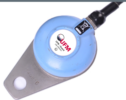
UFM Guard - sensor (ATEX)

We offer an optional DIN rail signal conditioner in order to create a complete pig detection system.