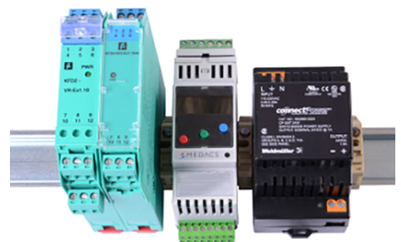
Optional: UFM Guard - DIN rail signal conditioner