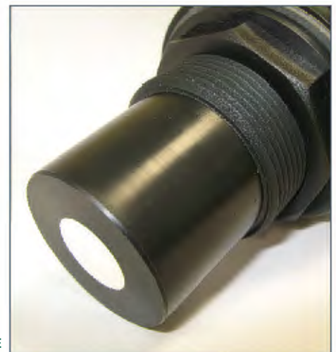
STANDARD IMP FACE