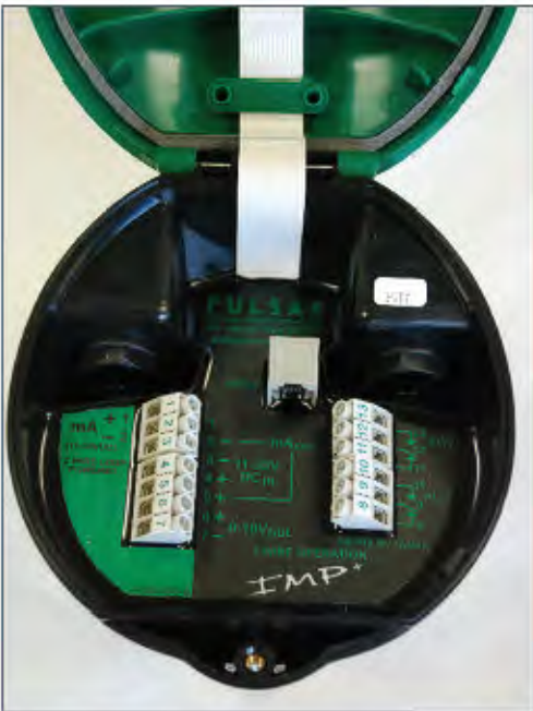
INSIDE OF STANDARD 2/3 WIRE IMP