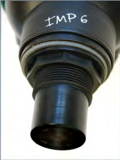
PVDF NOSE CONE OPTION

The full IMP range is available with the wetted parts in PVDF build alternative for corrosive or aggressive applications. The picture below shows a PVDF nose cone on an IMP 6 unit.