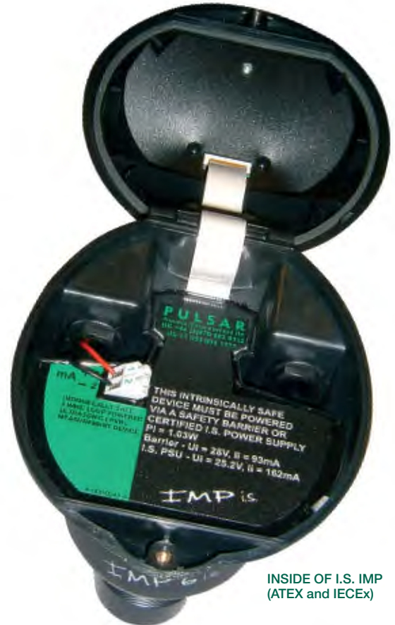
INSIDE OF I.S. IMP (ATEX and IECEx)

The full IMP range is available with the wetted parts in PVDF build alternative for corrosive or aggressive applications. The picture below shows a PVDF nose cone on an IMP 6 unit.