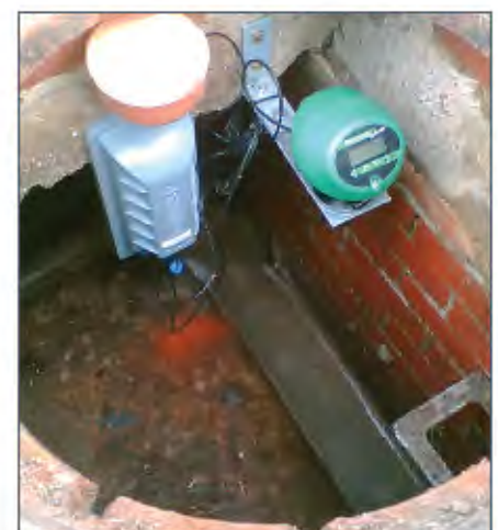
IMP MONITORING IN A CSO CHAMBER