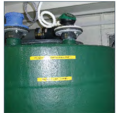
IMP ON CHEMICAL TANK