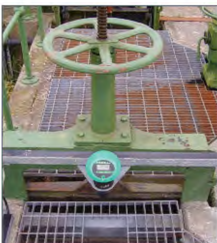
IMP CONTROLLING SCREEN HEIGHT