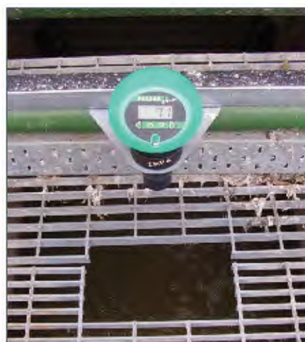
IMP CONTROLLING GATE HEIGHT