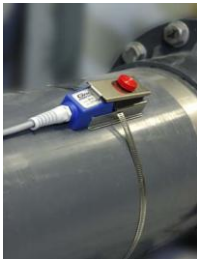
Easy to install

Each UFM-50 Doppler Flow Meter includes a clamp-on ultrasonic sensor, an adjustable stainless steel mounting clamp and sensor coupling compound. The sensor fits on the outside of any pipe diameter ½" (12.7 mm) or larger. It takes just a few minutes to install. There is no need to shut down flow.