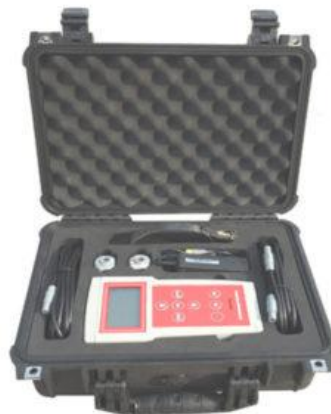
Portable unit in case